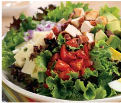
Arcadian Harvest® Cobb Salad