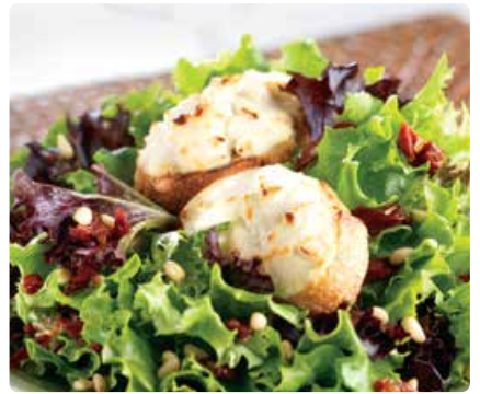
Arcadian Harvest® Goat Cheese Crostini Salad