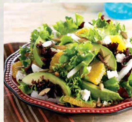
Mexican Summer Salad

Farm fresh from Mann’s - the family who brought you Broccolini®